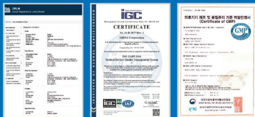
U.S. FDA 510K

The leading manufacturer of medical devices for Diabetes and supplies Safety syringes and Needles.